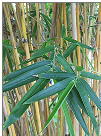
Alphonse Karr Bamboo foliage

This plant is not reliably hardy in our region, and certain restrictions may apply; contact the store for more information.