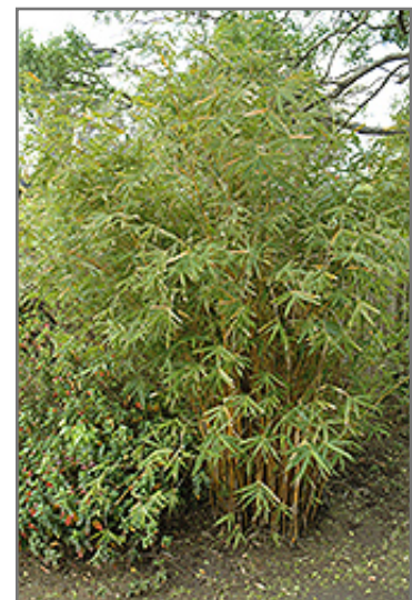
Alphonse Karr Bamboo foliage