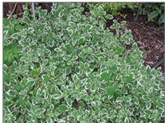
Variegated Parrot Feather