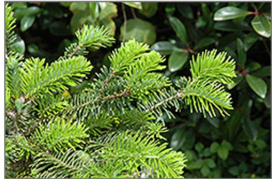
Delavay's Fir foliage

Delavay's Fir will grow to be about 40 feet tall at maturity, with a spread of 30 feet. It has a low canopy, and should not be planted underneath power lines. It grows at a slow rate, and under ideal conditions can be expected to live for 50 years or more.