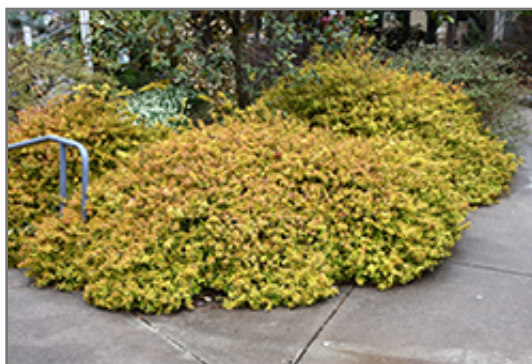
Kaleidoscope Abelia

This plant is not reliably hardy in our region, and certain restrictions may apply; contact the store for more information.