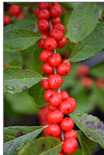
Red Sprite Winterberry fruit

Red Sprite Winterberry is recommended for the following landscape applications;