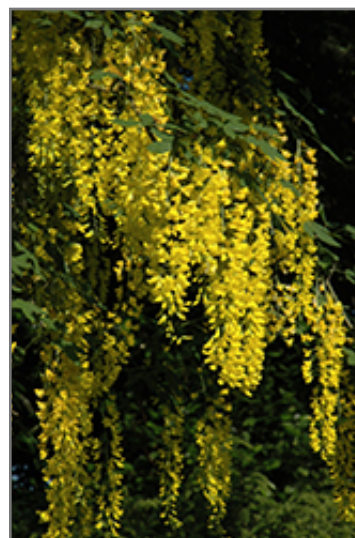
Weeping Laburnum flowers

Weeping Laburnum is recommended for the following landscape applications;