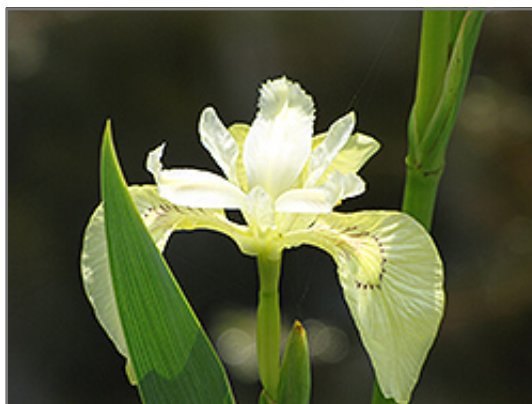
Milton Iris flowers