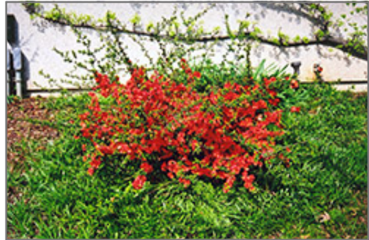
Common Flowering Quince in bloom