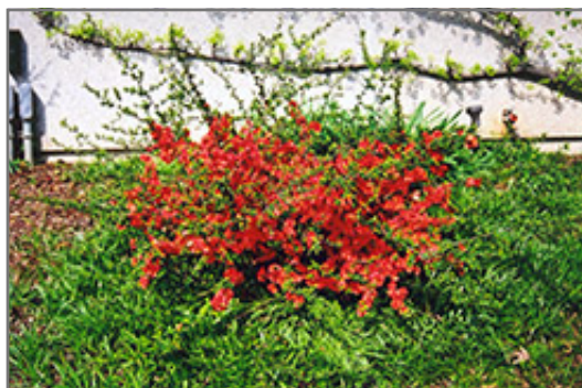
Common Flowering Quince in bloom