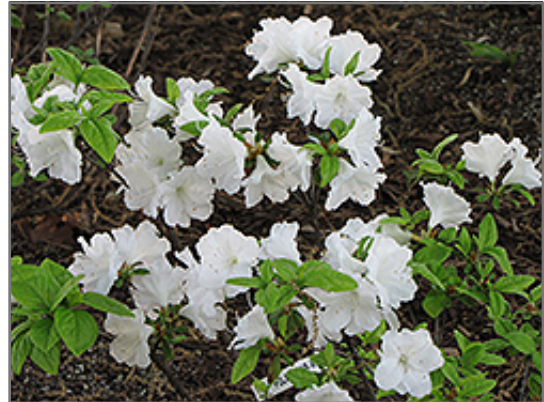
Polar Bear Azalea flowers

This captivating azalea is bathed in clusters of beautiful pure snow white blooms; an excellent choice to mass in groupings, or as an elegant focal point of the garden; must have rich acidic soil