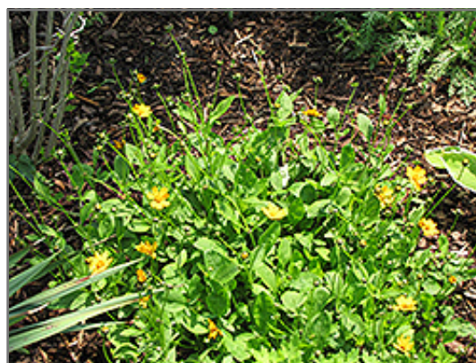
Sunshine Superman Tickseed in bloom