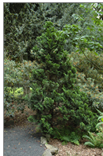
Nana Dwarf Hinoki Falsecypress