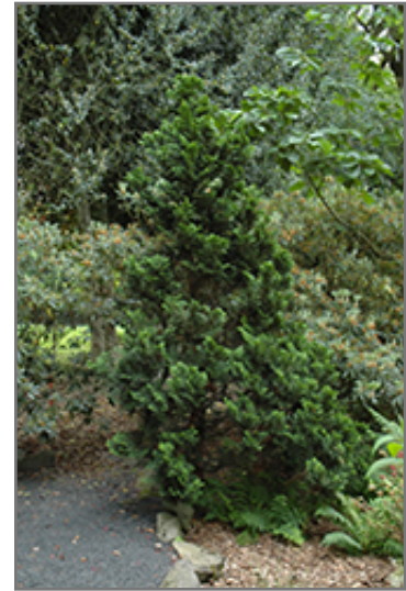
Nana Dwarf Hinoki Falsecypress