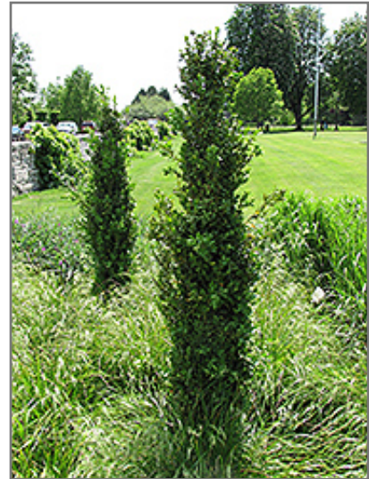
Graham Blandy Boxwood