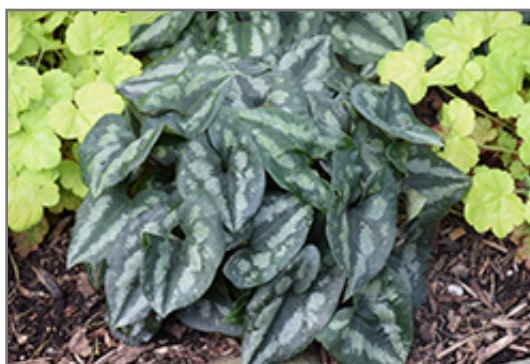
Asian Wild Ginger