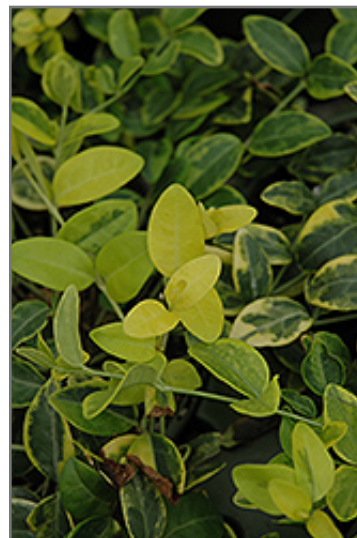
Sunny Skies Periwinkle flowers

Sunny Skies Periwinkle is recommended for the following landscape applications;