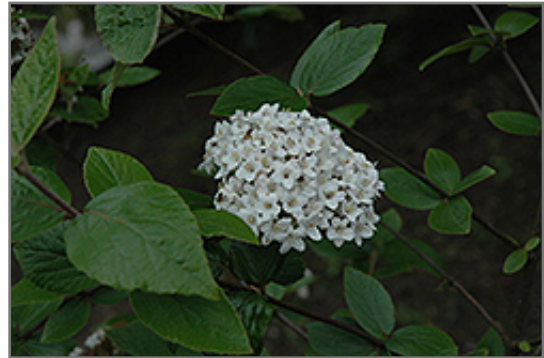
Chenault Viburnum flowers

Among the finest of garden shrubs, an upright mounded beauty with intensely fragrant ball-shaped clusters of pinkish-white flowers in early spring, plant where the fragrance can be enjoyed, red fruit persists through winter; an ideal border shrub