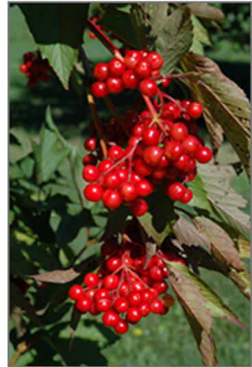
Hahs American Cranberry fruit

Hahs American Cranberry is recommended for the following landscape applications;