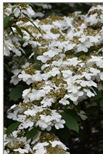
Shoshoni Doublefile Viburnum flowers