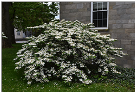
Shoshoni Doublefile Viburnum in bloom

Shoshoni Doublefile Viburnum is recommended for the following landscape applications;