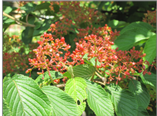
Shoshoni Doublefile Viburnum fruit

This plant is not reliably hardy in our region, and certain restrictions may apply; contact the store for more information.