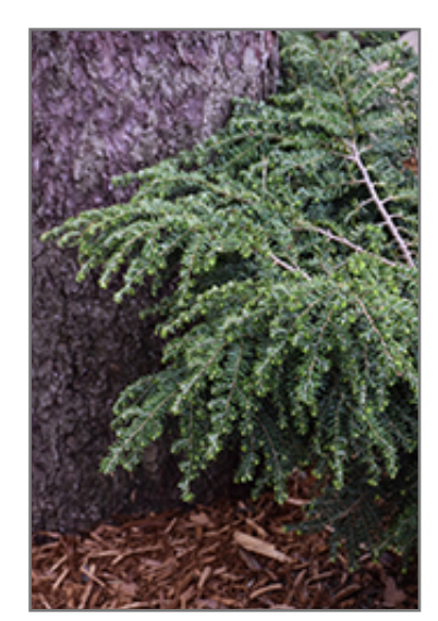
Dawsoniana Hemlock foliage