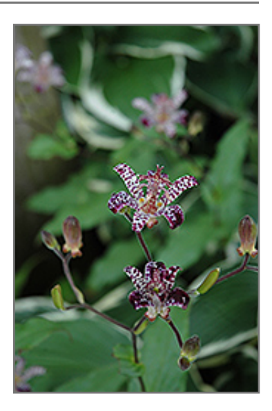
Empress Toad Lily flowers