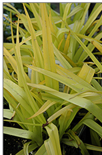
Sunshine Charm Spiderwort foliage

Sunshine Charm Spiderwort is recommended for the following landscape applications;