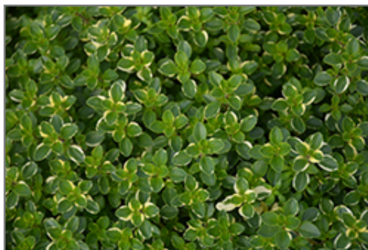
Variegated Broadleaf Thyme foliage