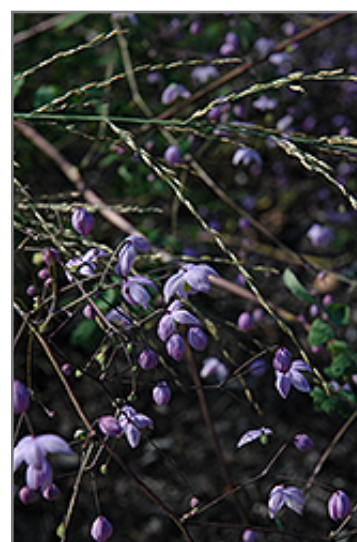
Splendide Meadow Rue flowers