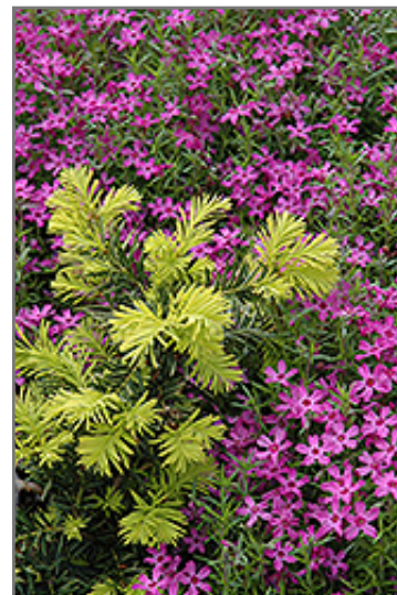
Watnong Gold Yew foliage