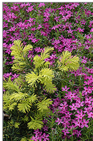
Watnong Gold Yew foliage