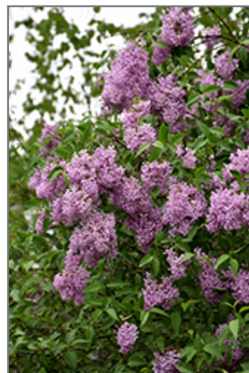
Persian Lilac flowers

Persian Lilac is recommended for the following landscape applications;