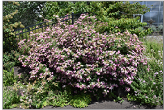
Lemon Princess Spirea in bloom

This plant is not reliably hardy in our region, and certain restrictions may apply; contact the store for more information.