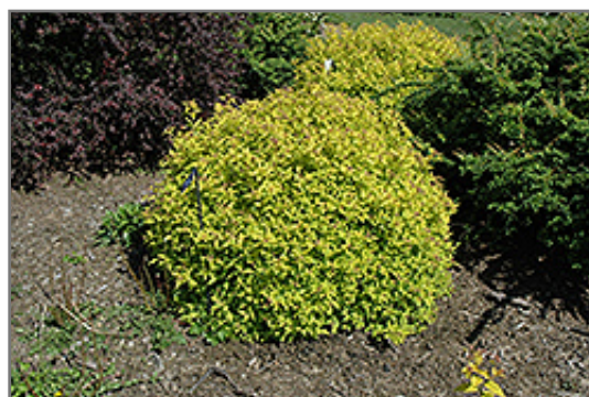
Lemon Princess Spirea