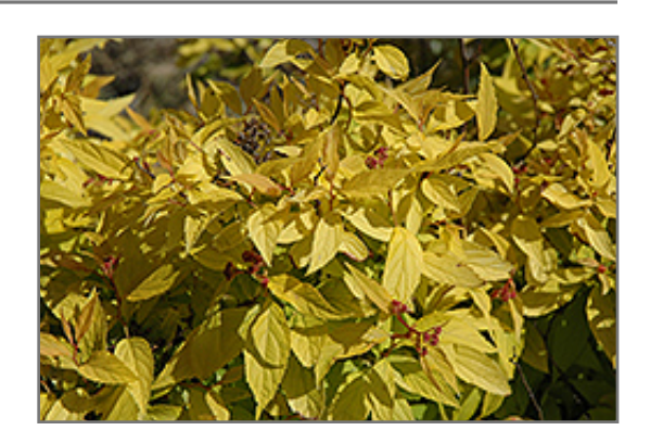
Golden Sunrise Spirea foliage

Golden Sunrise Spirea will grow to be about 3 feet tall at maturity, with a spread of 4 feet. It tends to fill out right to the ground and therefore doesn't necessarily require facer plants in front. It grows at a fast rate, and under ideal conditions can be expected to live for approximately 20 years.