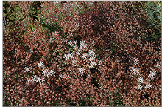
Royal Pink Stonecrop flowers

Royal Pink Stonecrop is recommended for the following landscape applications;