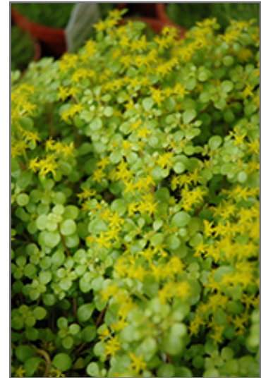
Golden Stonecrop flowers

Golden Stonecrop is recommended for the following landscape applications;