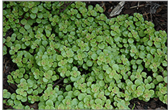
Golden Stonecrop

Golden Stonecrop will grow to be only 1 inch tall at maturity extending to 2 inches tall with the flowers, with a spread of 12 inches. When grown in masses or used as a bedding plant, individual plants should be spaced approximately 10 inches apart. Its foliage tends to remain low and dense right to the ground. It grows at a medium rate, and under ideal conditions can be expected to live for approximately 10 years. As an evergreen perennial, this plant will typically keep its form and foliage year-round.