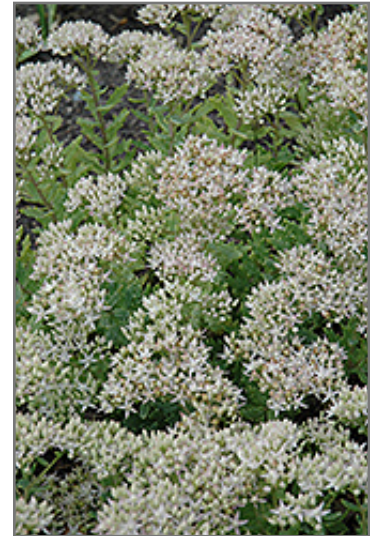
Thundercloud Stonecrop flowers

Thundercloud Stonecrop is recommended for the following landscape applications;