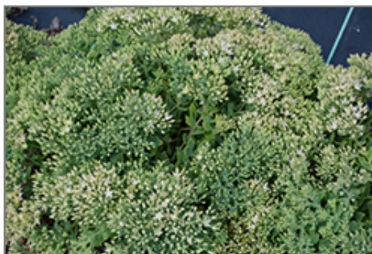
Thundercloud Stonecrop flower buds

Thundercloud Stonecrop will grow to be about 8 inches tall at maturity, with a spread of 10 inches. When grown in masses or used as a bedding plant, individual plants should be spaced approximately 8 inches apart. It grows at a fast rate, and under ideal conditions can be expected to live for approximately 15 years. As an herbaceous perennial, this plant will usually die back to the crown each winter, and will regrow from the base each spring. Be careful not to disturb the crown in late winter when it may not be readily seen!