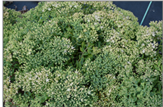
Thundercloud Stonecrop flower buds

Thundercloud Stonecrop will grow to be about 8 inches tall at maturity, with a spread of 10 inches. When grown in masses or used as a bedding plant, individual plants should be spaced approximately 8 inches apart. It grows at a fast rate, and under ideal conditions can be expected to live for approximately 15 years. As an herbaceous perennial, this plant will usually die back to the crown each winter, and will regrow from the base each spring. Be careful not to disturb the crown in late winter when it may not be readily seen!