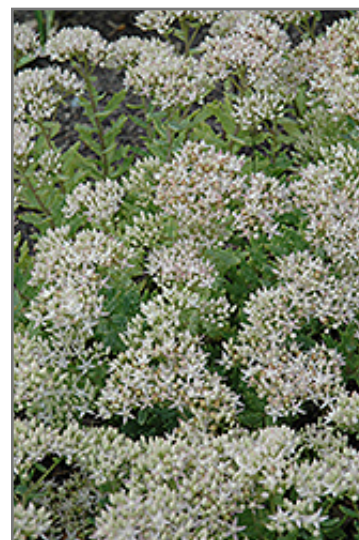
Thundercloud Stonecrop flowers

Thundercloud Stonecrop is recommended for the following landscape applications;