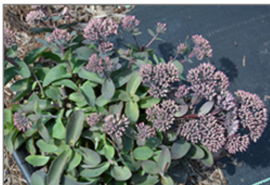
Chocolate Drop Stonecrop flower buds

This plant is not reliably hardy in our region, and certain restrictions may apply; contact the store for more information.