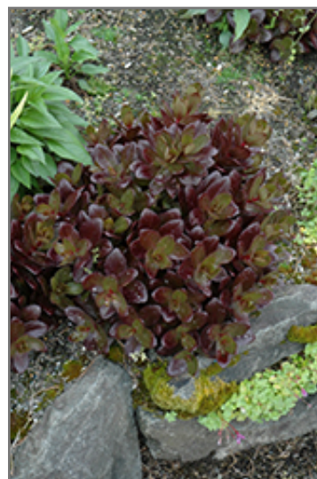
Chocolate Drop Stonecrop

This is a relatively low maintenance plant, and is best cleaned up in early spring before it resumes active growth for the season. It is a good choice for attracting butterflies to your yard, but is not particularly attractive to deer who tend to leave it alone in favor of tastier treats. It has no significant negative characteristics.