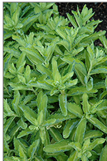
Autumn Delight Stonecrop foliage

Autumn Delight Stonecrop is a fine choice for the garden, but it is also a good selection for planting in outdoor pots and containers. It is often used as a 'filler' in the 'spiller-thriller-filler' container combination, providing a mass of flowers and foliage against which the larger thriller plants stand out. Note that when growing plants in outdoor containers and baskets, they may require more frequent waterings than they would in the yard or garden. Be aware that in our climate, most plants cannot be expected to survive the winter if left in containers outdoors, and this plant is no exception. Contact our experts for more information on how to protect it over the winter months.