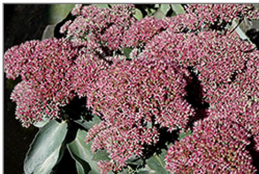
Autumn Delight Stonecrop flowers

This is a relatively low maintenance plant, and is best cleaned up in early spring before it resumes active growth for the season. It is a good choice for attracting butterflies to your yard, but is not particularly attractive to deer who tend to leave it alone in favor of tastier treats. It has no significant negative characteristics.