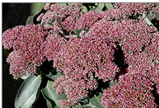
Autumn Delight Stonecrop flowers

This is a relatively low maintenance plant, and is best cleaned up in early spring before it resumes active growth for the season. It is a good choice for attracting butterflies to your yard, but is not particularly attractive to deer who tend to leave it alone in favor of tastier treats. It has no significant negative characteristics.