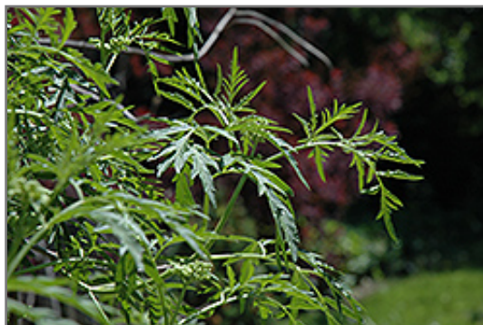
Acutiloba American Elder foliage

A large, vigorous shrub featuring lime green foliage all season long and attractive clusters of small, white flowers in spring followed by deep purple-black berries; very adaptable, survives with minimal care but tends to sucker