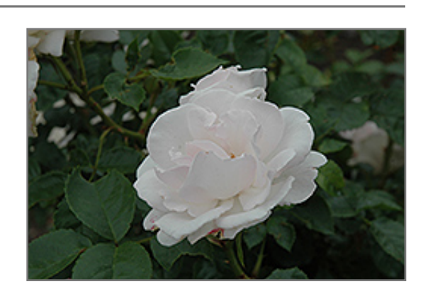
City of London Rose flowers