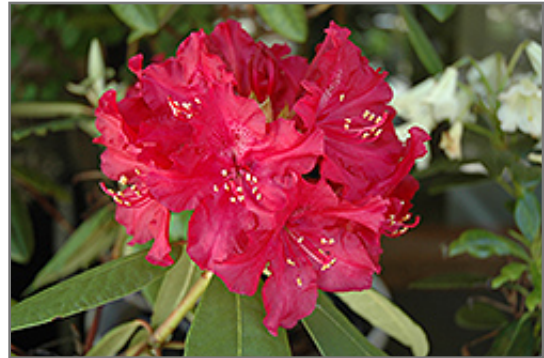
Red Brave Rhododendron flowers

Beautiful hot pink blooms with white centers that extend behind a dark red blotch gives this variety unusual interest; an accent shrub that will definitely make an impact; absolutely must have well-drained, highly acidic and organic soil