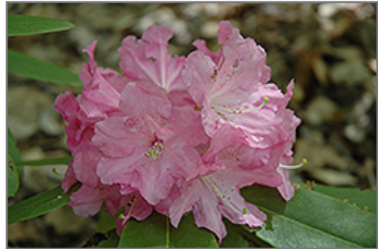
Pink Flourish Rhododendron flowers

Beautiful shell pink blooms with white throats and very few dark red spots adorn this variety in mid spring; an accent shrub that will definitely make an impact; absolutely must have well-drained, highly acidic and organic soil