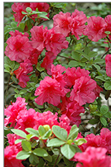
Pink Dawn Azalea flowers

Pink Dawn Azalea will grow to be about 5 feet tall at maturity, with a spread of 5 feet. It tends to be a little leggy, with a typical clearance of 1 foot from the ground, and is suitable for planting under power lines. It grows at a slow rate, and under ideal conditions can be expected to live for 40 years or more.