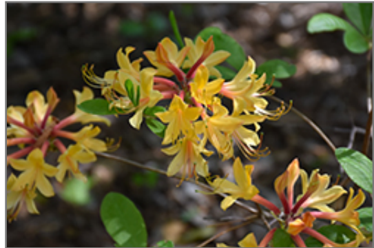
My Mary Azalea flowers

My Mary Azalea will grow to be about 4 feet tall at maturity, with a spread of 4 feet. It tends to be a little leggy, with a typical clearance of 1 foot from the ground. It grows at a slow rate, and under ideal conditions can be expected to live for 40 years or more.