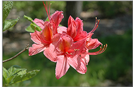
Ilam Pink Williams Azalea flowers

Ilam Pink Williams Azalea will grow to be about 6 feet tall at maturity, with a spread of 6 feet. It tends to be a little leggy, with a typical clearance of 1 foot from the ground, and is suitable for planting under power lines. It grows at a slow rate, and under ideal conditions can be expected to live for 40 years or more.