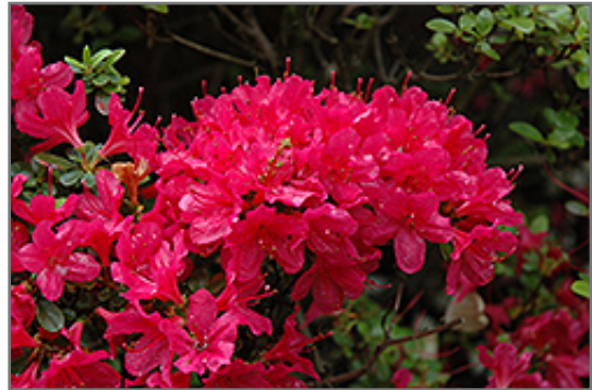
Hino Crimson Azalea flowers

This plant is not reliably hardy in our region, and certain restrictions may apply; contact the store for more information.