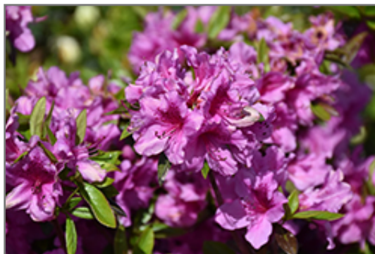
Herbert Azalea flowers

Herbert Azalea will grow to be about 4 feet tall at maturity, with a spread of 4 feet. It tends to be a little leggy, with a typical clearance of 1 foot from the ground. It grows at a slow rate, and under ideal conditions can be expected to live for 40 years or more.