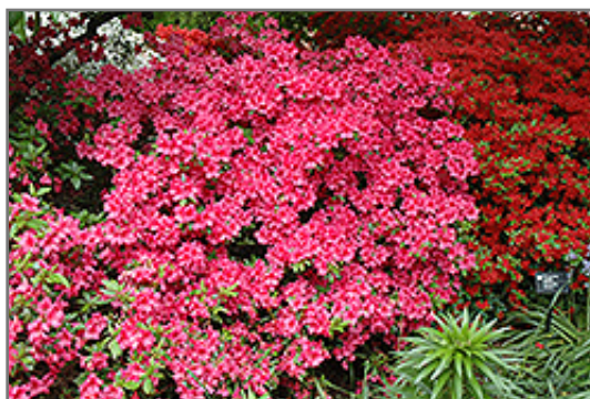
Girard's Rose Azalea in bloom