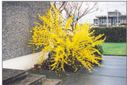
Showy Border Forsythia in bloom