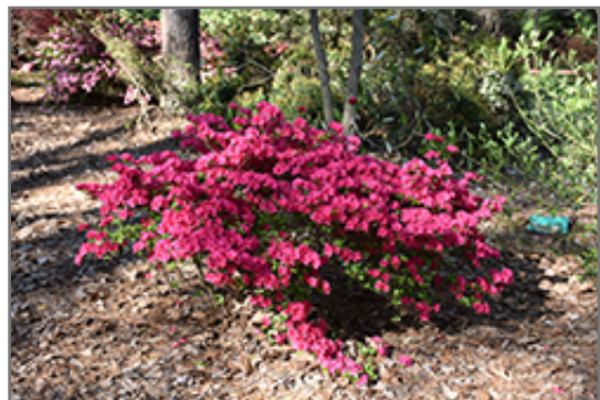
Girard's Fuchsia Evergreen Azalea in bloom