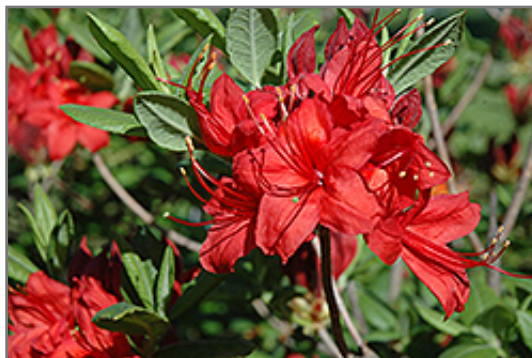
Copper Cloud Azalea flowers

Copper Cloud Azalea will grow to be about 6 feet tall at maturity, with a spread of 6 feet. It tends to be a little leggy, with a typical clearance of 1 foot from the ground, and is suitable for planting under power lines. It grows at a slow rate, and under ideal conditions can be expected to live for 40 years or more.