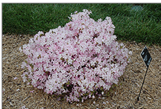
Bubblegum Rhododendron in bloom