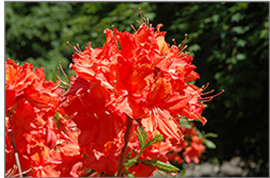
Balzac Azalea flowers

Balzac Azalea will grow to be about 5 feet tall at maturity, with a spread of 5 feet. It tends to be a little leggy, with a typical clearance of 1 foot from the ground, and is suitable for planting under power lines. It grows at a slow rate, and under ideal conditions can be expected to live for 40 years or more.