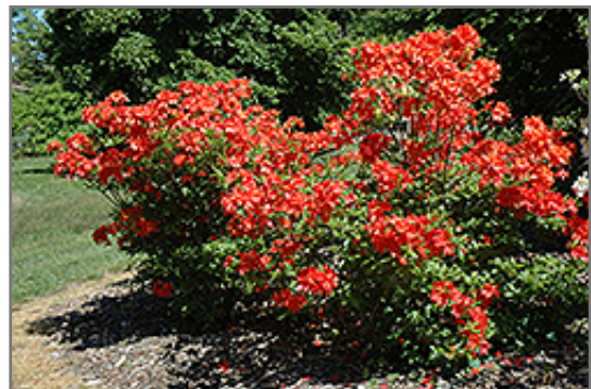
Balzac Azalea in bloom