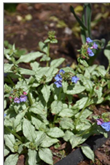
Moonshine Lungwort in bloom

Moonshine Lungwort is recommended for the following landscape applications;