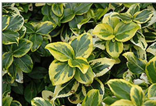
Gold Prince Wintercreeper foliage