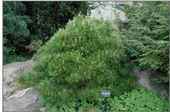
Low Glow Japanese Red Pine

This plant is not reliably hardy in our region, and certain restrictions may apply; contact the store for more information.