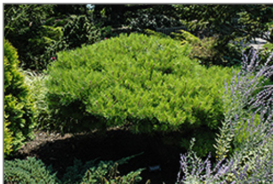
Low Glow Japanese Red Pine