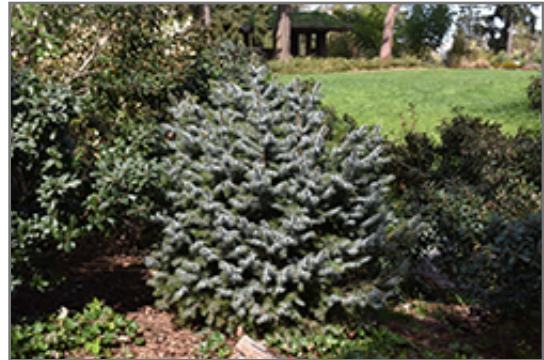
Papoose Dwarf Sitka Spruce